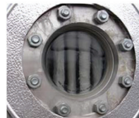
Smart Deodorizer Design